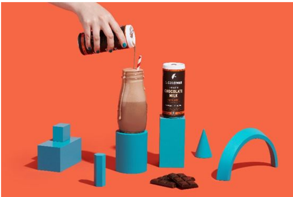
La Colombe Chocolate Milk

The single Origin Brazilian cold Brew is a convenient on-the-go pick-me-up. The canned coffee is brewed from fresh roast and double-filtered for a smooth, clean flavor and natural sweetness.