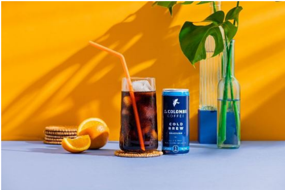
Brazilian Cold Brew in a can by La Colombe