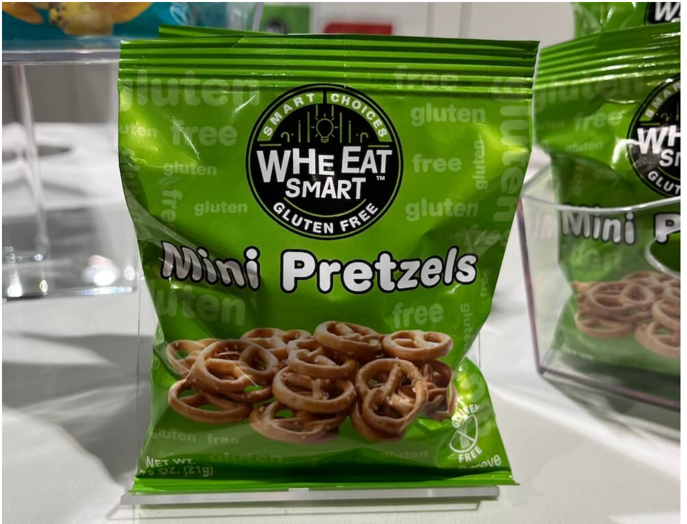
Whe Eat Smart gluten free snacks mini pretzels