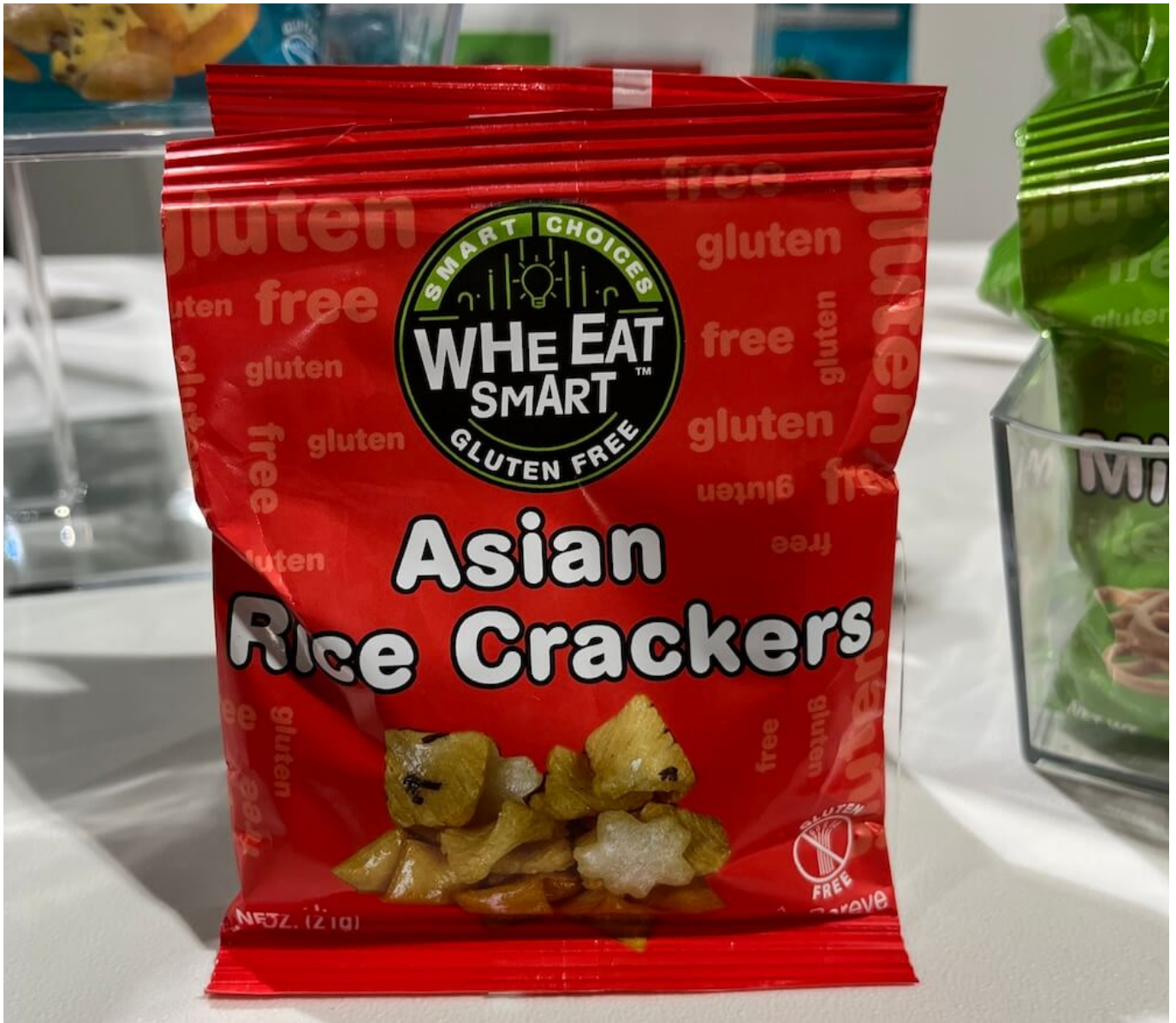
The Asian rice crackers product