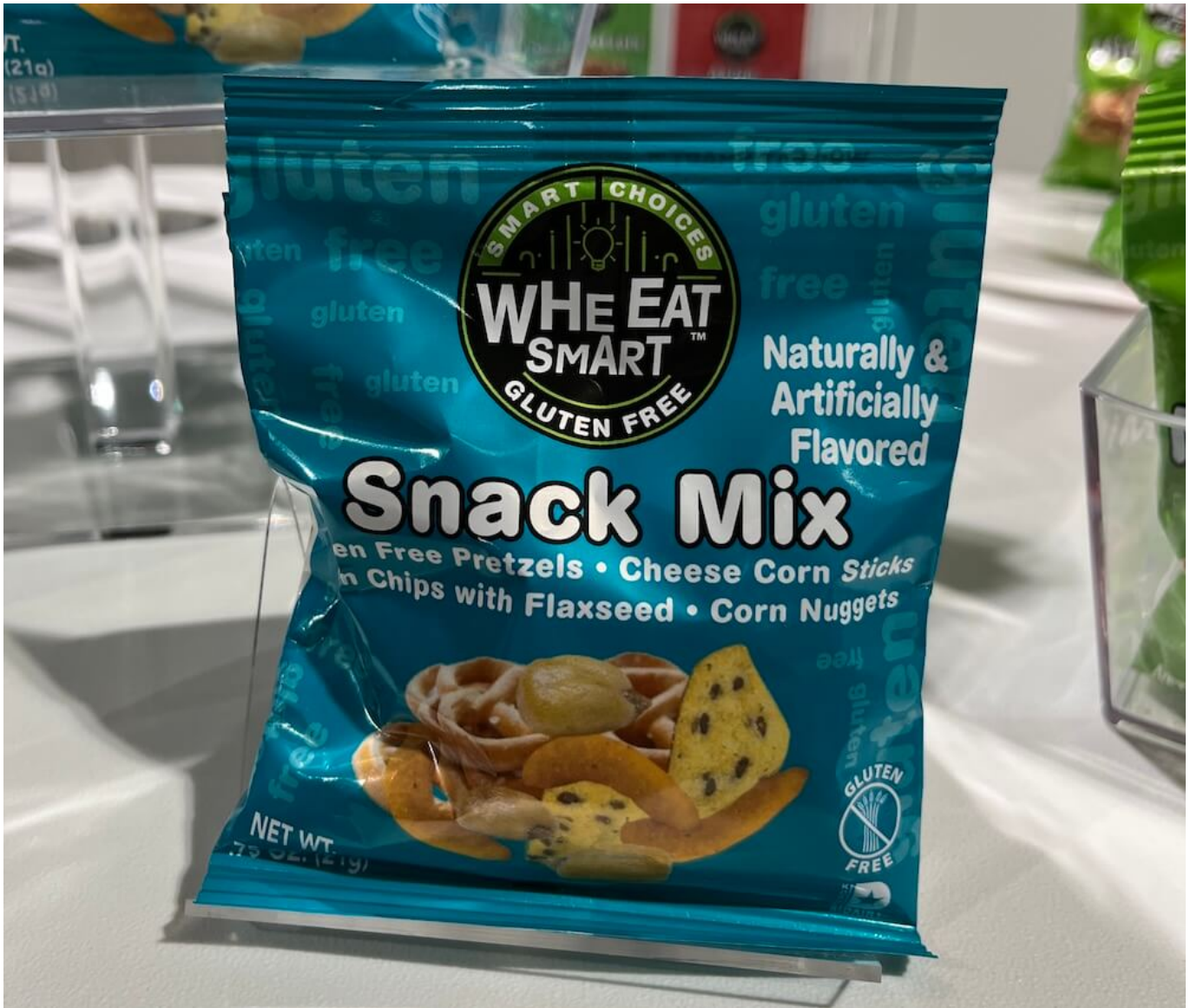
Whe Eat Smart's snack mix, including pretzels, cheese corn sticks, corn sticks with flaxseed and corn nuggets