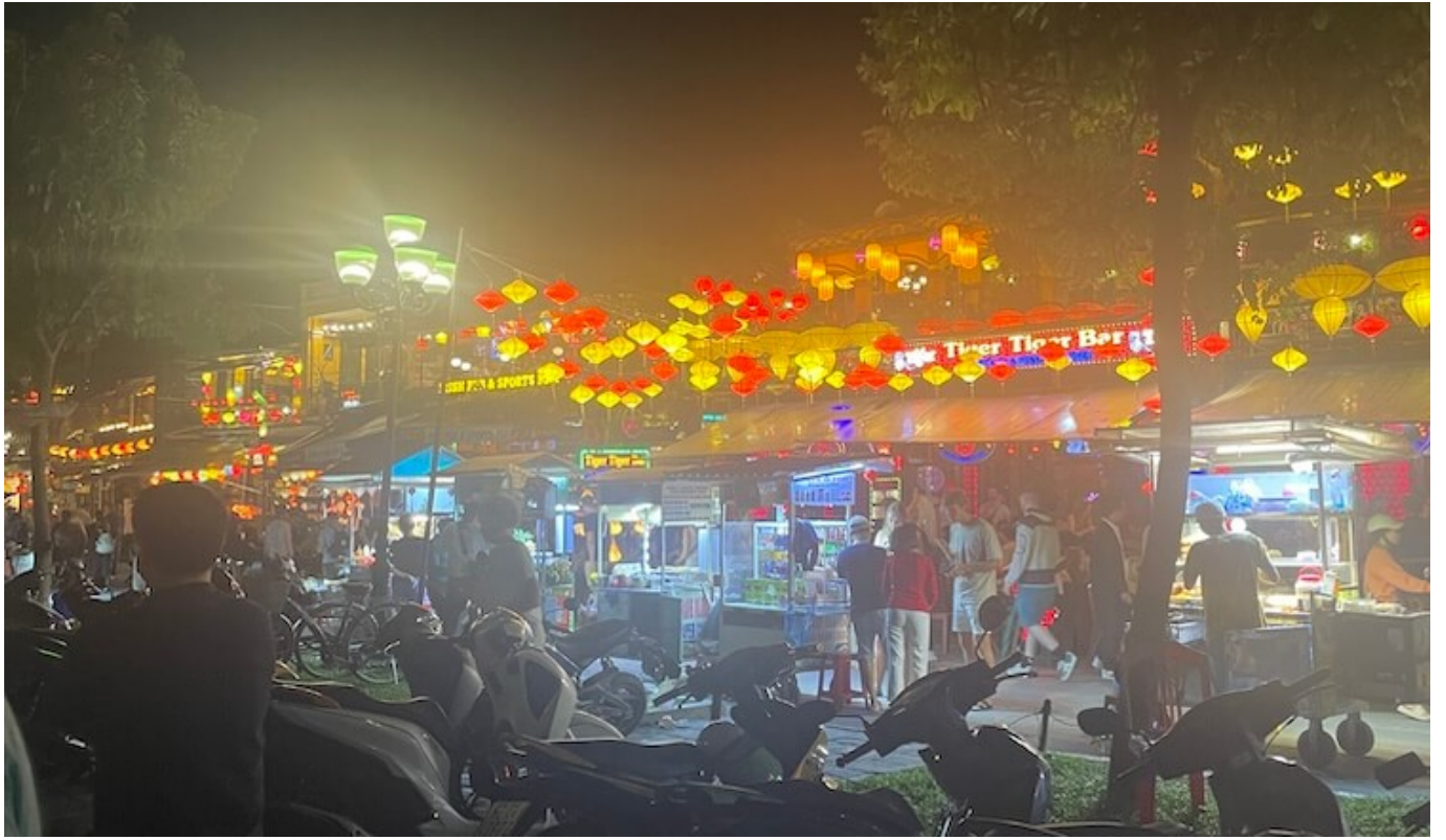
Hoi An at night