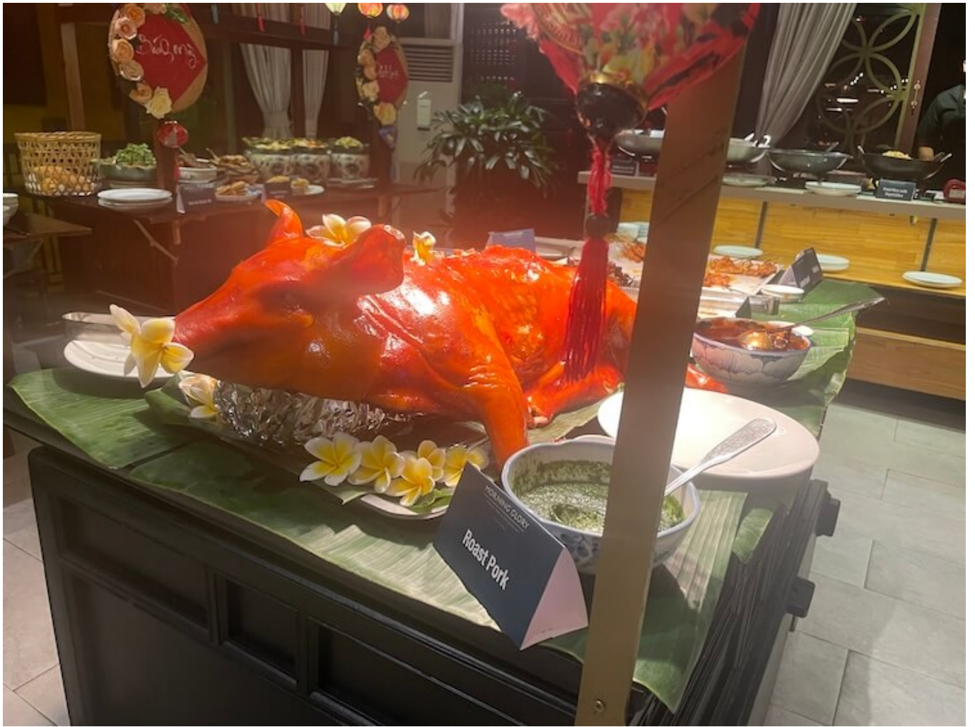
Roast pork was served at the dinner