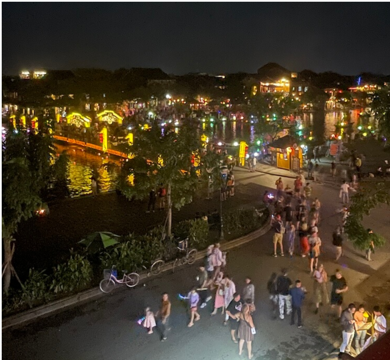
View of Hoi An water at night from Vy's Restaurant