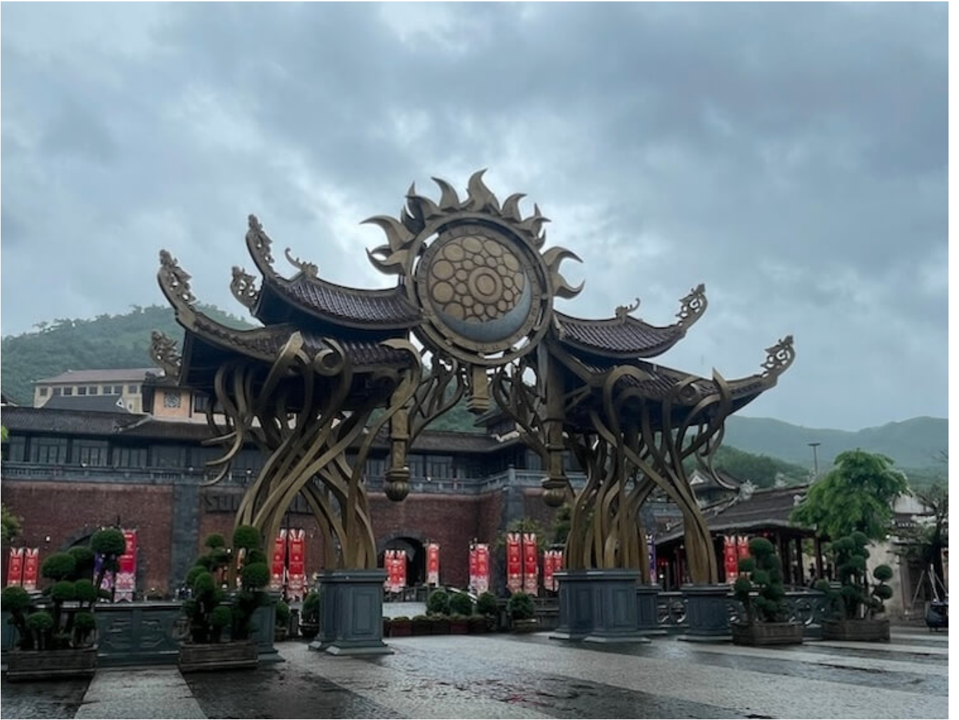
Architecture at Ba Na Hills