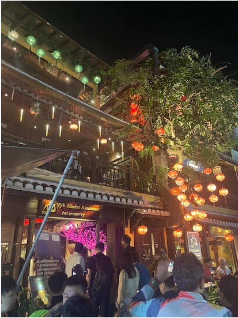
View of Vy's Restaurant from outside