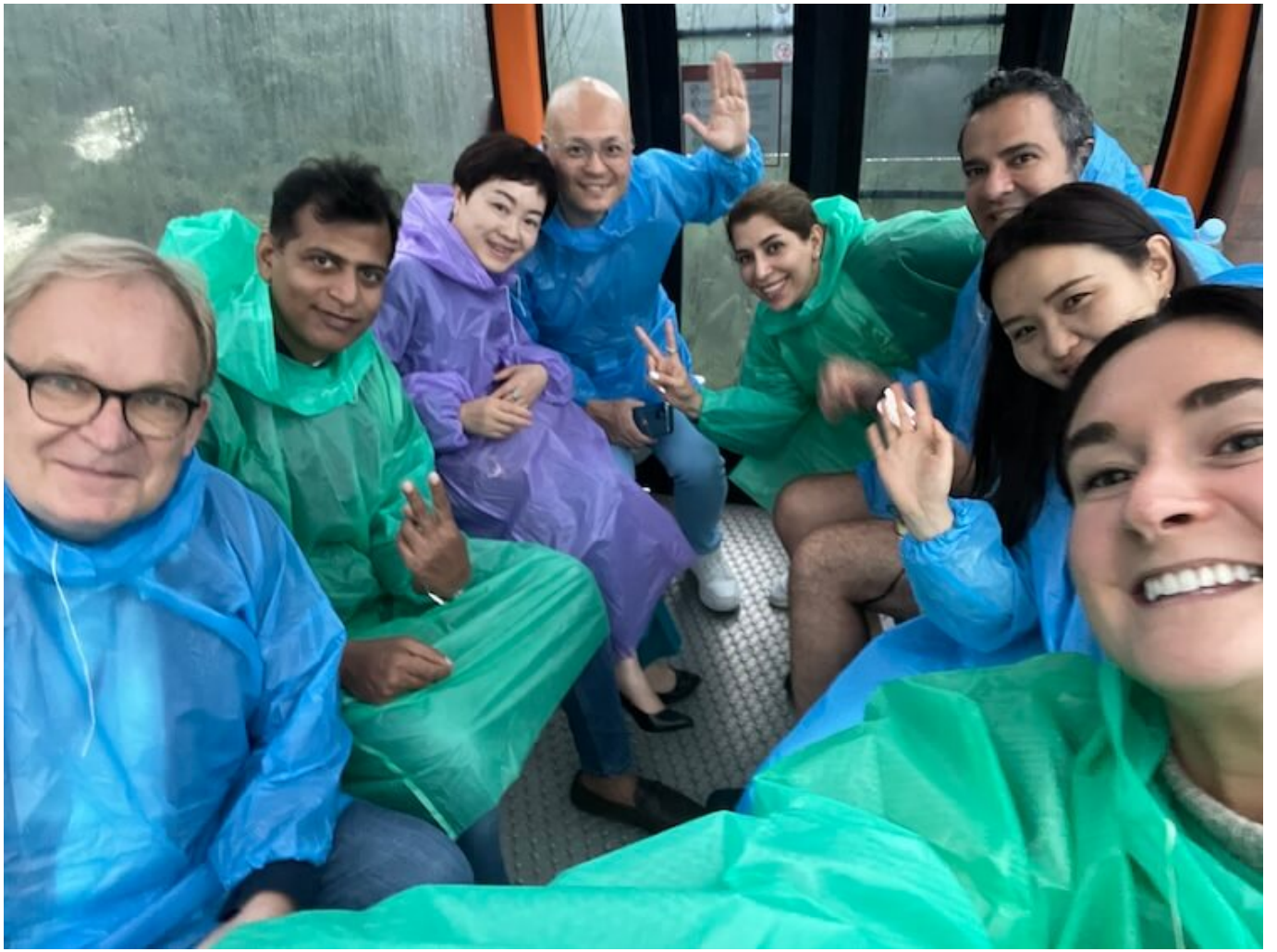
The cable car ride