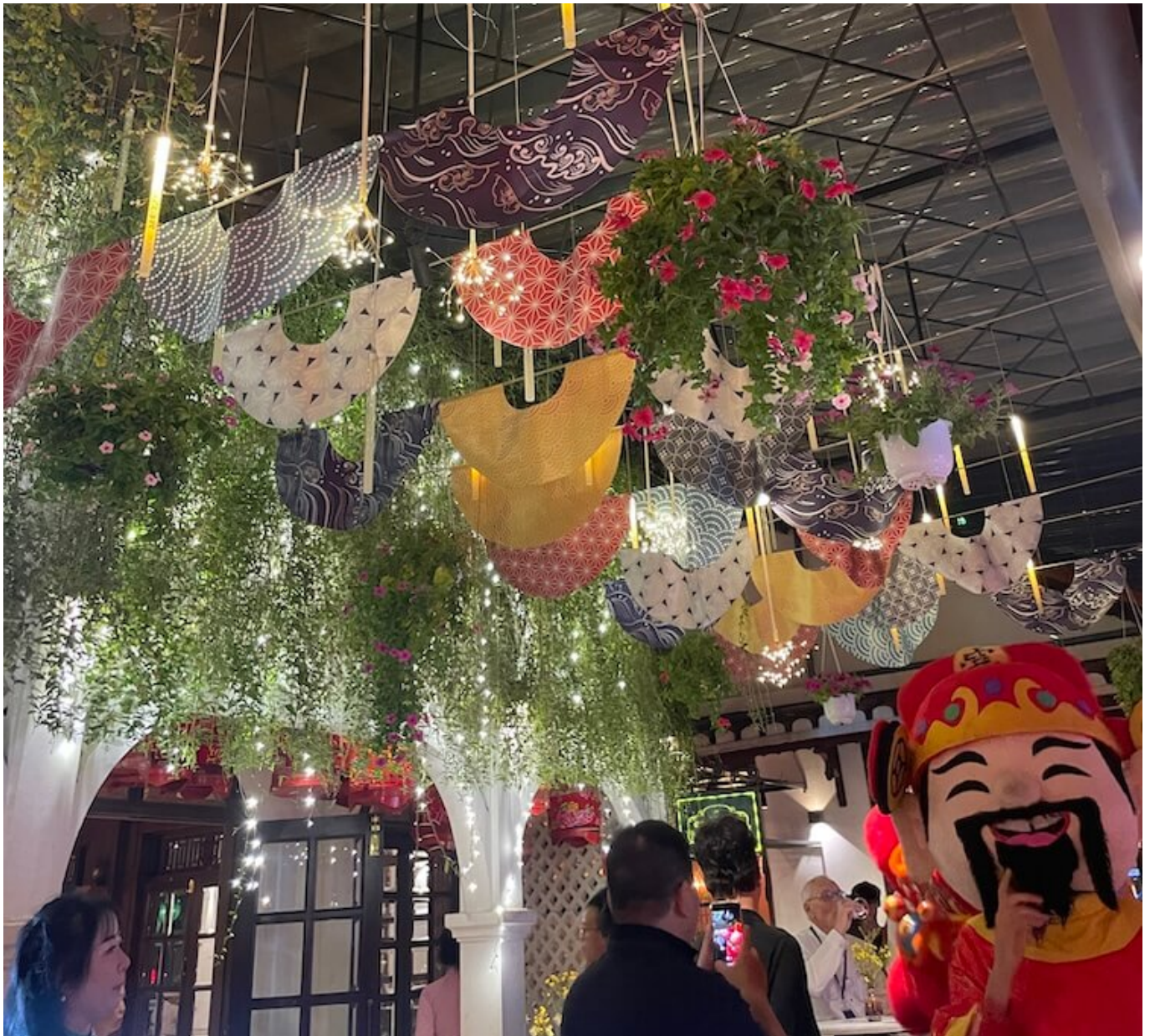
Atmosphere at Vy's Restaurant