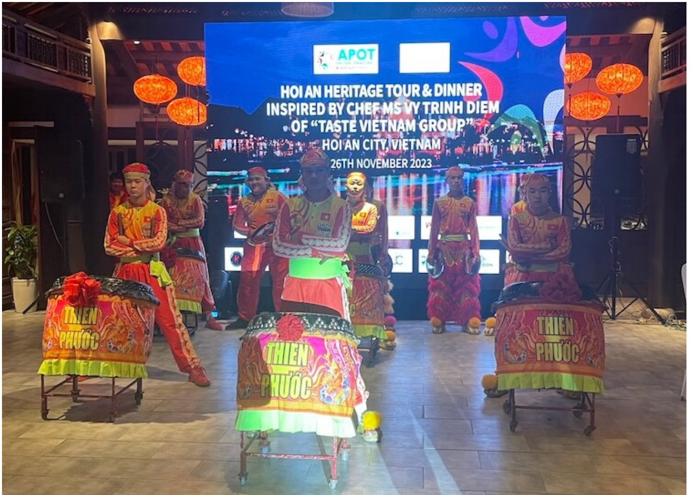
Entertainment during APOT Networking Event 2023