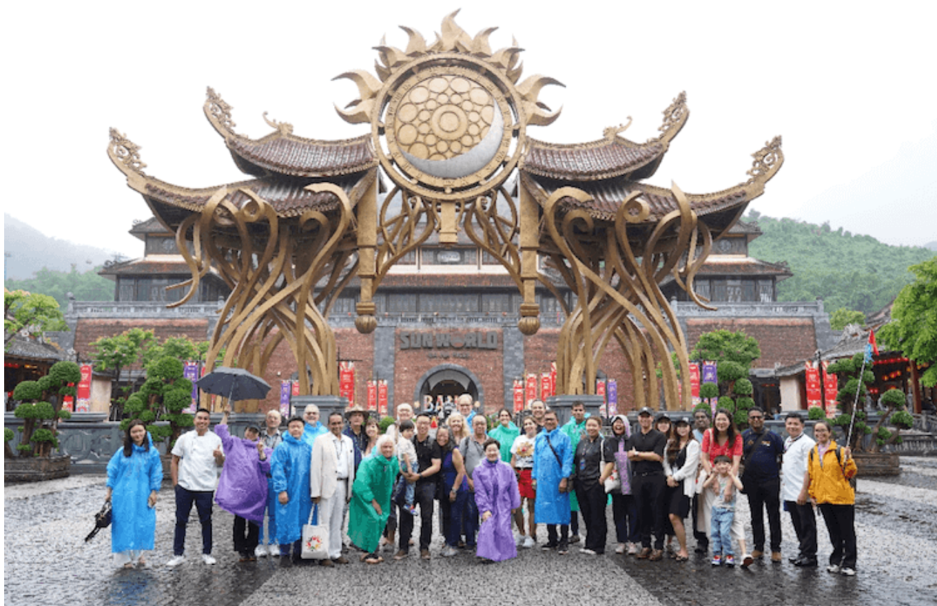
Group at Ba Na Hills.

APOT treated its 2023 Networking Event attendees to a tour of Ba Na Hills and Hoi An today, in partnership with Tourism Da Nang and one of the city's top tour operators Asian Companion Travel. Delegates boarded the bus at Furama Resort around 12:30 p.m., right after the judging for the CATRION cooking competition wrapped up.