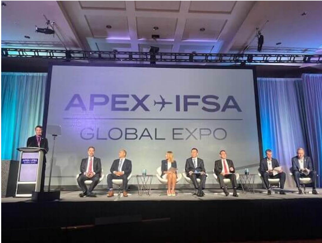
The APEX/IFSA Board of Governors meeting

This year, APEX/IFSA and FTE are hosting several major industry events globally, from Asia to Europe to North America. Industry members should mark their calendars and keep an eye on the PAX website to learn more about these upcoming gatherings: