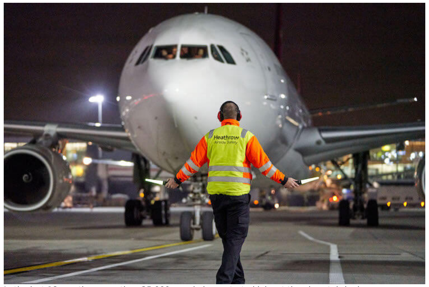
In the last 18 months, more than 25,000 people have started jobs at the airport, bringing resource levels close to those of pre-pandemic

Annual losses in 2022 decreased from £1,270 million (US$1,526 million) to £684 million (US$822 million), but the airport cites inflation, lower passenger numbers and insufficient regulated charges as factors impacting underlying profitability.