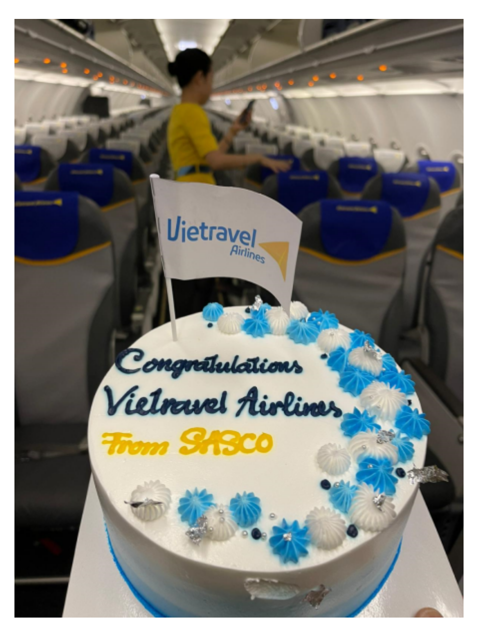
The celebratory cake from SASCO