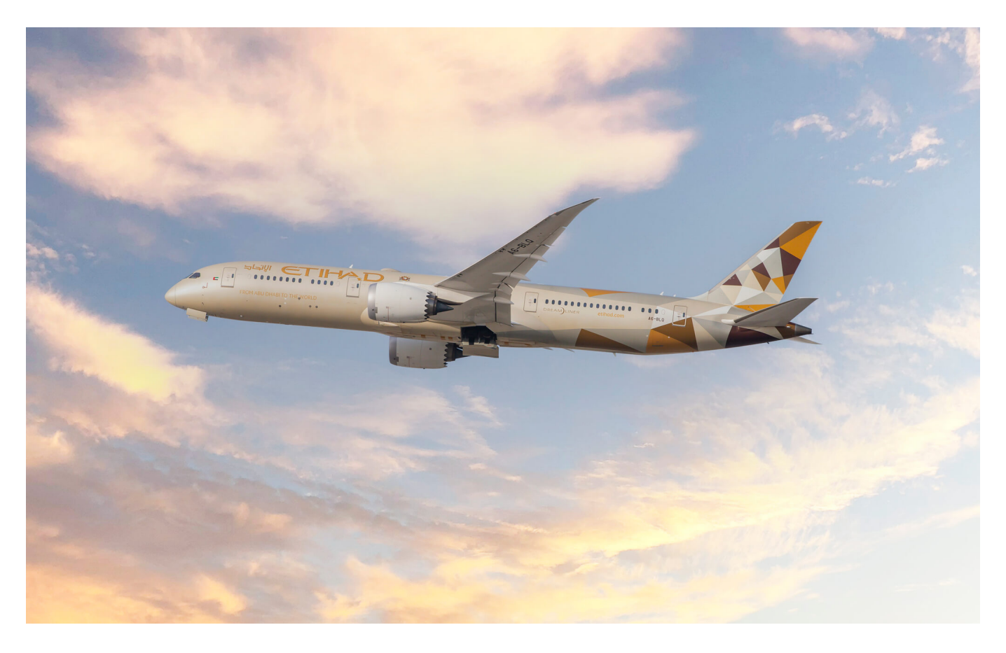
Etihad's upgraded Dreamliner fleet features free inflight Wi-Fi for all cabin classes and upgraded entertainment systems

This is a special feature from PAX Tech's April 2024 Seating & IFEC issue, on page 13