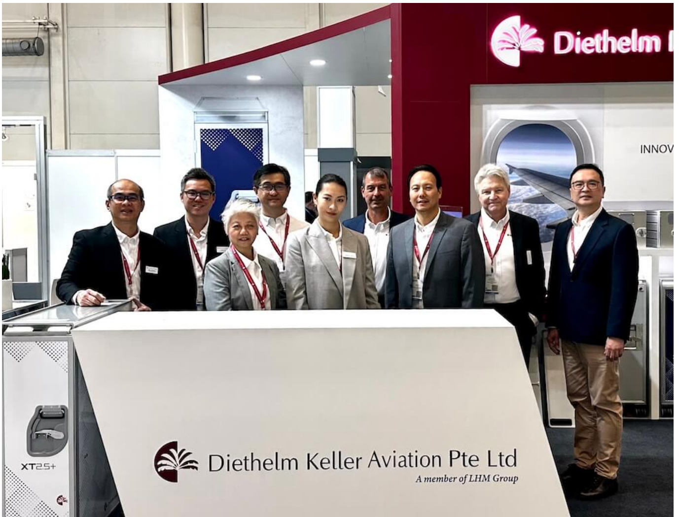
DKA's team at WTCE 2024

This is a special feature from PAX International's October 2024 IFSA Global EXPO issue.