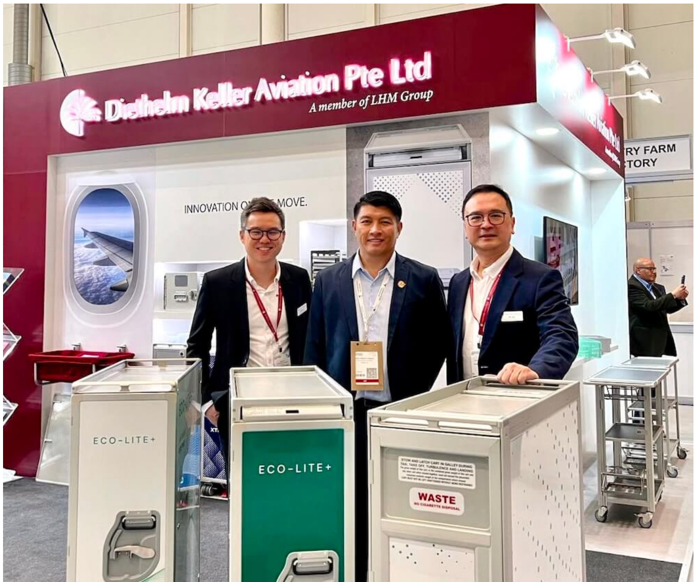
DKA's team poses with the Eco-Lite+ cart at WTCE 2024

maintenance, showing strong interest in this new cart series.”