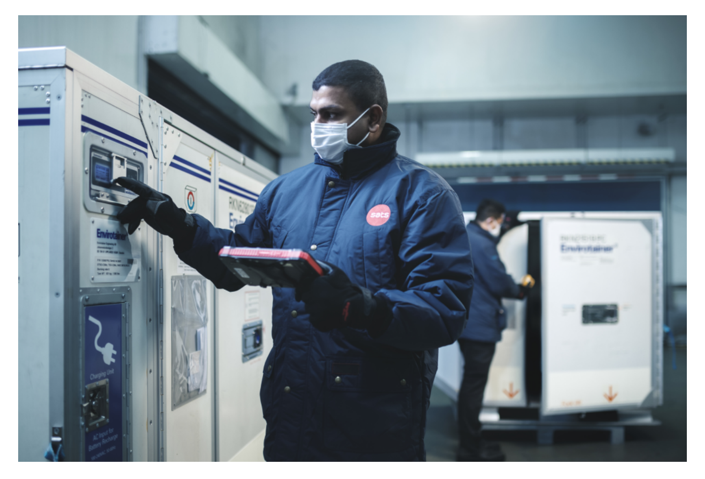
The SATS Coolport received its CEIV Pharma certification from IATA in 2010

This is a special feature from PAX International 's December 2020 <u>FTE APEX Virtual Expodigital edition</u>.