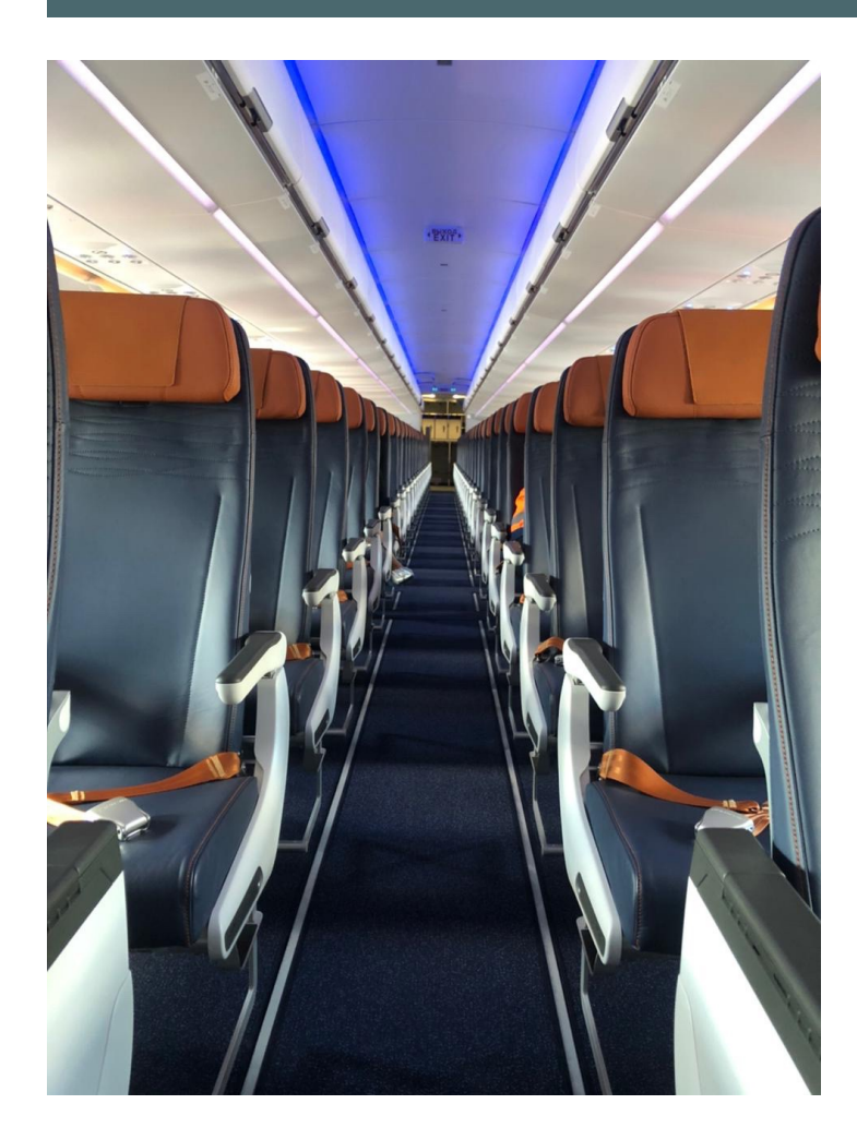
Recaro's BL3710 Economy Class seat

<u>Recaro Aircraft Seating</u> is equipping <u>Aeroflot's</u> Airbus fleet with more than 50 shipsets of the BL3710 and CL4710.